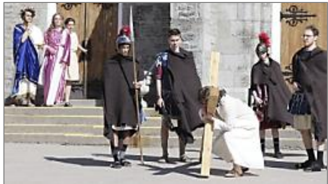
VIEW IMAGES OF PAST ENACTMENTS

On Good Friday, April 18 th , the young people will once again reenact the Stations of the Cross in the streets of downtown Peterborough! Beginning with a prayer service at the Cathedral of St. Peter-in-Chains at 10:00 a.m. , the young actors will don period-authentic costumes and re-present Jesus' Passion and crucifixion at each intersection along Hunter Street, concluding on the front steps of Immaculate Conception Parish . It is a powerful and moving testimony of faith from our young people and it is an inspiring event for both young and old. All are welcome to join in this deeply moving experience!